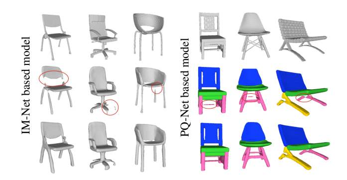
Figure 3: 3D shape reconstruction results. First row: ground truth shape; Second row: baseline network reconstruction. Problematic regions are marked by red ovals; Third row: our network reconstruction. Our approach yields better and more feasible results.