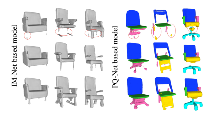
Figure 4: 3D shape correction results. First row: corrupted input shape. Problematic regions are marked by red ovals; Second row: baseline network correction. Third row: our network correction. Our approach outperforms the baselines.

input corrupted shapes that are fed to E_G then decoded by baseline G and our G' decoders. For visual convenience, we use the mesh representation of the input voxels in the provided figures. Our approach shows improvement over baseline for both G networks. Furthermore, quantitative results also support the superiority of our approach by increasing the VR from 18.9% to 34.9% using our IM-Net [15] based G' and from 37.2% to 69.8% using our PQ-Net [71] based G'. Overall, we find that physically-aware approach is considerably more accurate than the baseline in remedying connectivity and stability failures. Significantly, this improvement is obtained with a single forward pass through our decoder, and the result can be further optimized at test time.