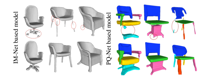
Figure 1: Visual results for 3D shape generation. We sample vectors from the latent space of IM-Net [15] and PQ-Net [71] that we decode using the corresponding baseline network (first row) and our generative network trained with the proposed physical losses (second row). Problematic regions are marked by red ovals. The resulting shapes become more connected and physically stable.

3D shape generation is a central problem in both computer vision and computer graphics. The main challenge is to minimize manual intervention in the design process, while enabling the creation of new, diverse and plausible shapes. Early efforts focused on synthesizing new shapes by borrowing and assembling parts from existing collections, combining probabilistic models with geometric constraints, e.g., [23, 12, 39] among many others. More recently, deep generative methods, in particular, adversarial networks [28] and variational auto-encoders [51] have gained popularity in various applications showing promising results. However, existing works only focus on geometric, visual and structural plausibility, largely ignoring the fact that synthesized