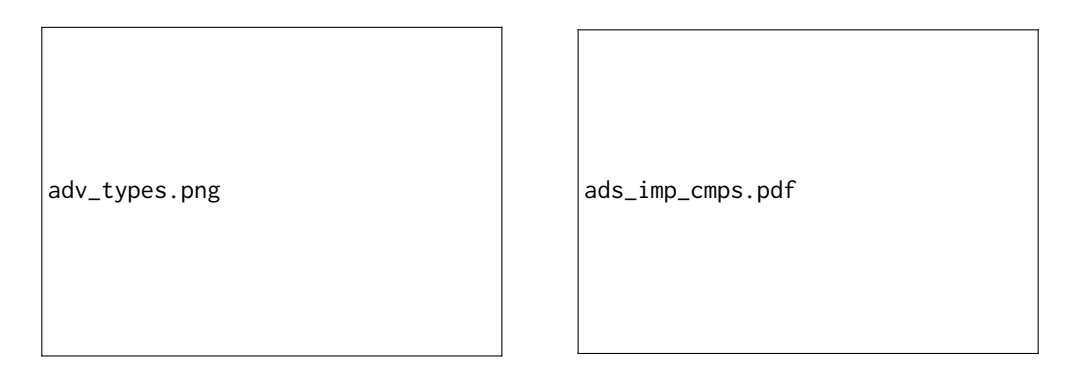
Fig. 1. Fraction of advertisers with different business size for timeline-advertisers and adsettings-advertisers .