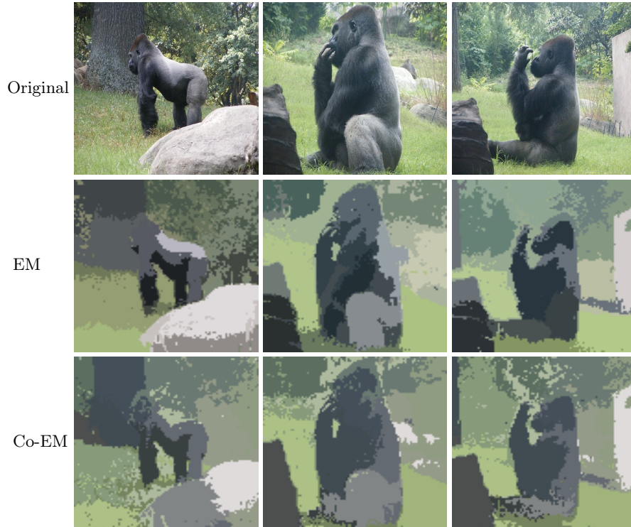
Fig. 1. Segmentation with regular EM and co-EM using a 5D RGBxy description of the images.

This aggregation step gives the same weight to all the set of points, no matter the number of components inside, allowing to remove the influence of various set of points sizes.