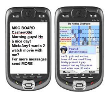
Figure 5: User interfaces of TMC and GMC respectively