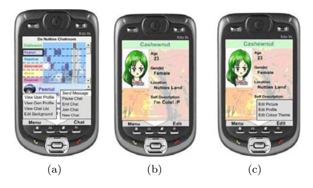
Figure 4: 4(a) Menus, 4(b) Chatter's profile, 4(c) Edit profile