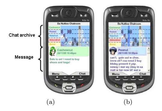
Figure 1: 1(a) Externalisation with 5 chatters and non-scrollable turn, 1(b) Externalisation with 5 chatters and scrollable turn