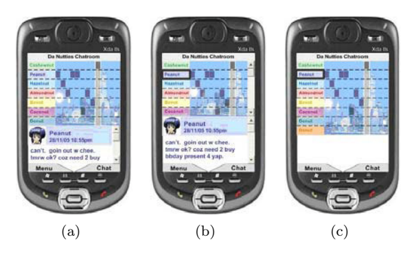
Figure 2: 2(a) Externalisation with 7 chatters and 2 displayable lines of message, 2(b) Externalisation with 8 chatters and 3 displayable lines of message, 2(c) Externalisation with 8 chatters

comprehension and identification of chatters within a group. Moreover, the interaction among chatters can be enriched through the interpretation of background images. The adoption of the images in chat archive externalisation (refer to Figure 4(a)) is to create a shared context which introduces and promotes conversation. On the contrary, utilisation of the images in users profile (refer to Figure 4(b)) is to imply a surrounding influential environment that participants are in, and to reinforce intent as well as content.